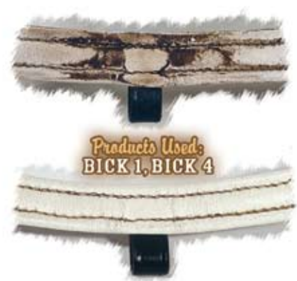
Products Used: BICK 1, BICK 4