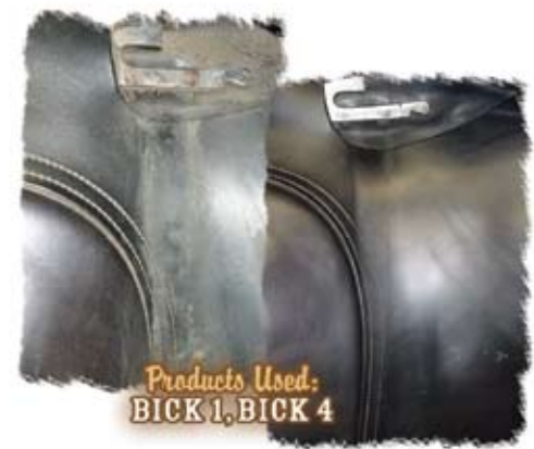
Products Used: BICK 1, BICK 4