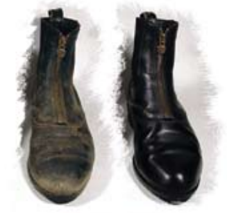
Products Used: BICK 1, BICK 4, GARD-MORE, BLACK CREME POLISH