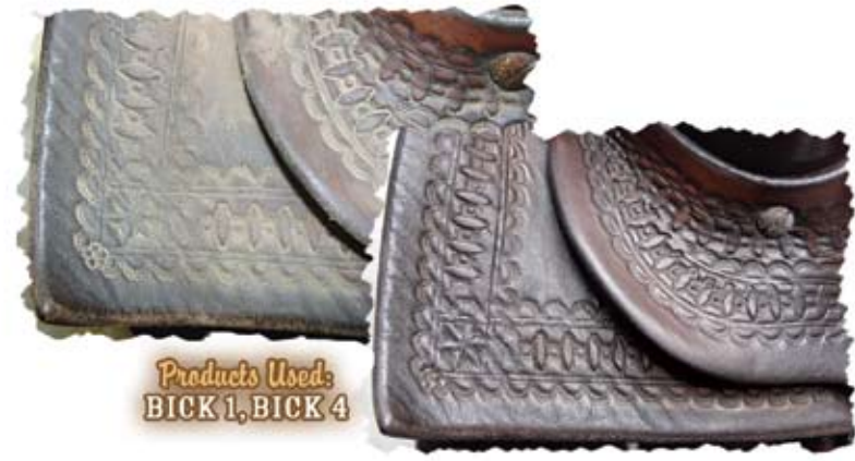
Products Used: BICK 1, BICK 4